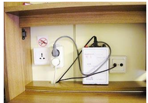
Sockets & Plugs

Chargers of most electronic devices like cell phones, tablets, and cameras can function normally in the wide power voltage of 110~240V. Most hotels ranking above 3 stars in China provide electrical outlets of both 110V and 220V in the bathrooms, though in guest rooms usually only 220V sockets are available.